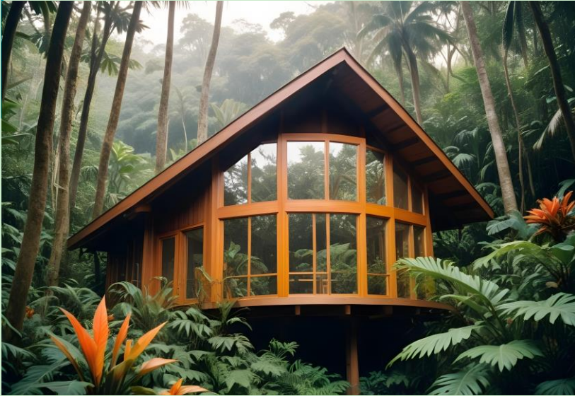
A – 2/3 bed