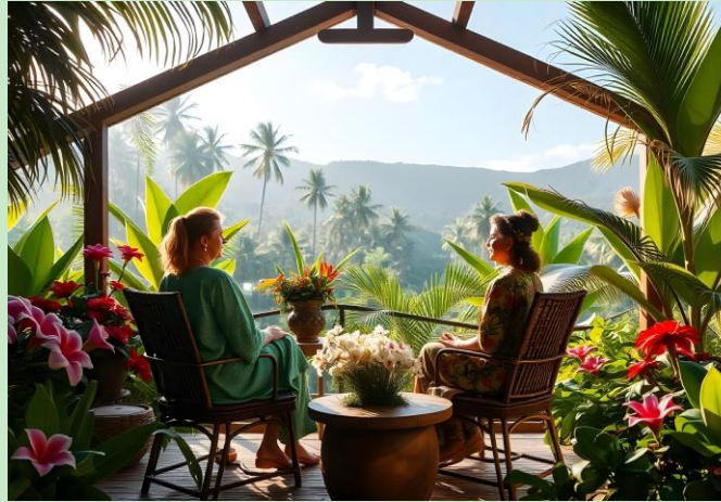
Ai Generated Artist impression of Architect's Design